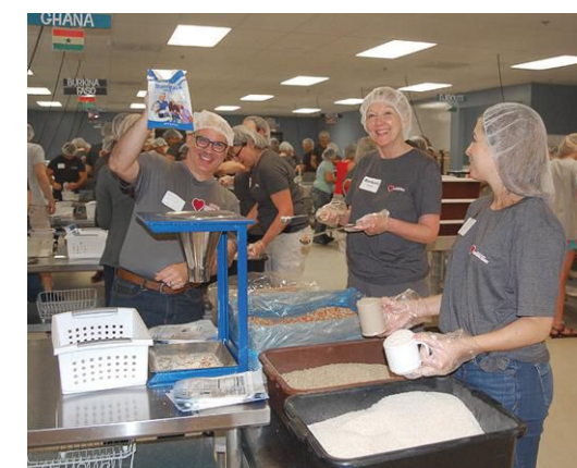
As part of last year's Giving Back efforts, members of Lochner's leadership gathered ahead of their annual conference to package more than 54,860 shelf-stable meals for children across the globe. Participants represented nearly every office location and ranged from associates to the firm's CEO and board members.