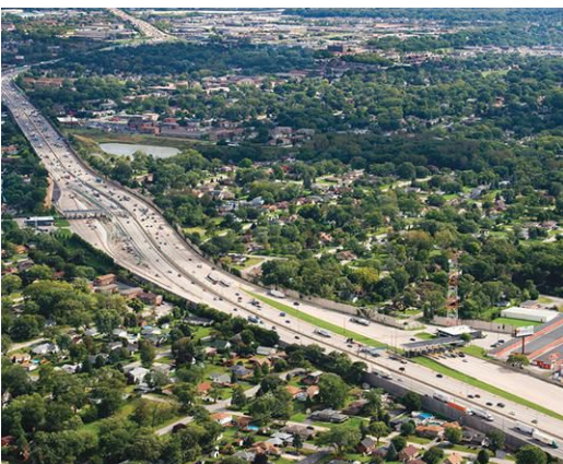
Lochner supported Phase II engineering for roadway widening and bridge reconstruction on the $190-million Tri-State Tollway between 95 th Street and LaGrange Road in Cook County, Ill.

tangible impact on the firm and their communities. This empowerment is still at the core of Lochner's business and the reason the firm continues to prosper 75 years later. ♦